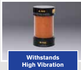
Withstands High Vibration