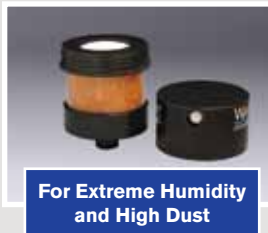
For Extreme Humidity and High Dust