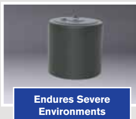
Endures Severe Environments