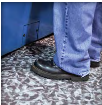
● INCREASE SAFETY ●