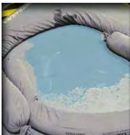
● CONTAIN LIQUIDS ●