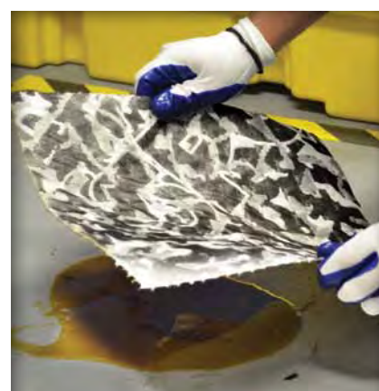
● CLEAN UP SPILLS ●